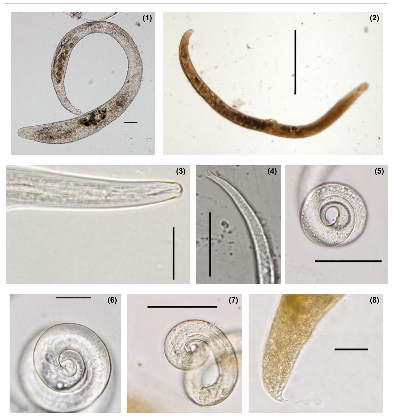
Figure 1 – 8. Parasitylenchus pseudobifurcatus sp.n. (1) First generation entomoparasitic female. (2). Second generation parasitic female. (3) Anterior end of vermiform infective female. (4) Posterior end of vermiform infective female, showing tail bifurcated. (5) Posterior end of male showing the spicules triangular shaped and gubernaculum laminar. (6) Posterior end of male showing the spicules in bowling bottle shape. (7) Posterior end of male showing the spicules and gubernaculum long and wide. (8) Posterior end of female showing the tail bifurcated. Bars = (1) 100 \mu m; (2) 500 \mu m; (3, 6) 20 \mu m; (4, 5, 7, 8) 50 \mu m.

Males (Figs. 5, 6, 7): pharyngeal glands atrophied; tail tip angular-truncate, showing bifurcation in juveniles; spicules straight, in bowling bottle shape or triangular, with wide base. The gubernaculum long can assume several shapes, laminate and in bowling bottle shape. Usually it is straight, however it may be bent upward, or rarely appear double. Unfortunately the small size of this structure hinders further analysis. The bursa is absent