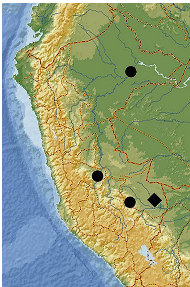
Figure 10. Distribution of Hybolabini. Hybolabus ater , circle. Omolabus curticornis , rhombus.