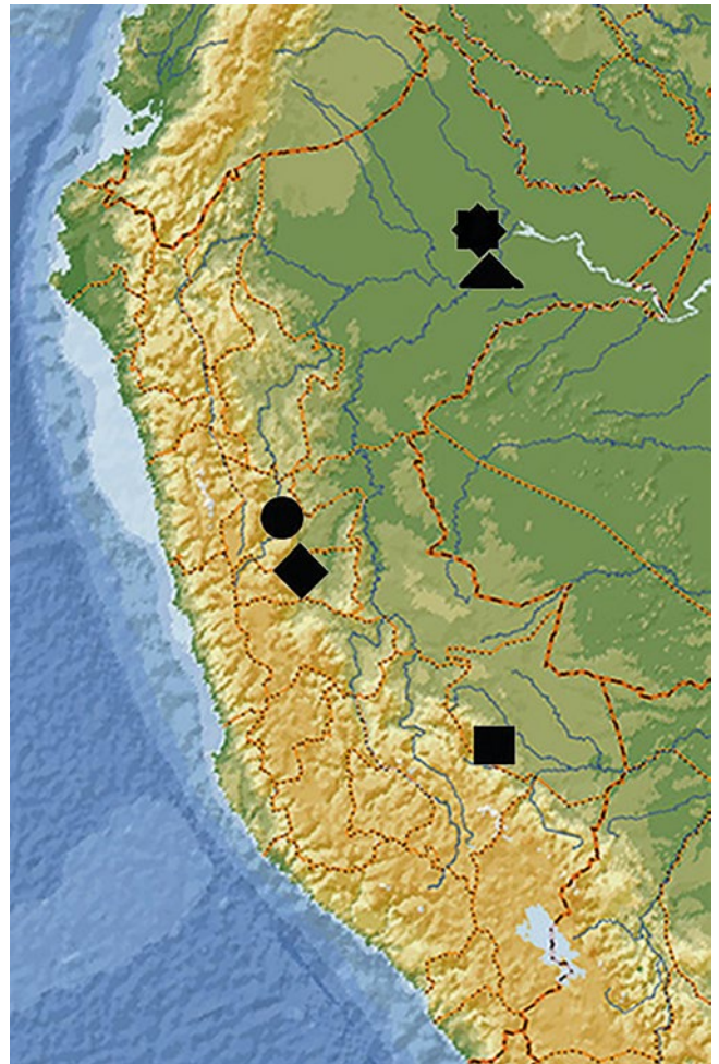
Figure. 9. Distribution of Attelebinae. Vossieuscelus huanucus , circle. Clinolabus flavomarginatus , square. Euscelus peruanus , Omolabus lituratus and O. rubellus , square. Vossieuscelus lineatus , rhombus. Pheleuscelus subimpressus , hexahedron. Emphyleuscelus iquitensis and Omolabus peruanus , triangle.

= Attelabus atratus Fabricius, 1801 = Attelabus cupripennis Perty, 1832 = Attelabus variabilis Gyllenhal, 1833 = Attelabus sallei Jekel, 1860 = Hybolabus ater ssp. peruanus Voss, 1925 = Hybolabus ater f. ruficollis Voss, 1938