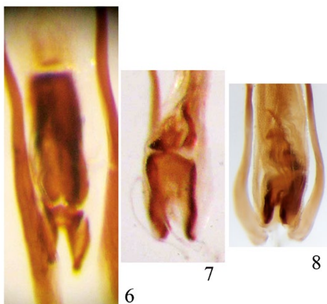
Figures 6 – 8. Omolabus (Sternolaboides) ssp., armament of the endophallus. 6). O. curticornis , 7). O. bowringi , lectotype, 8). O. ecuadorensis .