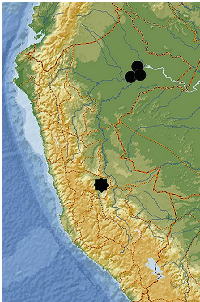
Figure 12. Distribution of Attelabinae. Omolabus ecuadorensis and O. westerduijni , circle. O. sokolovi new species, hexahedron.