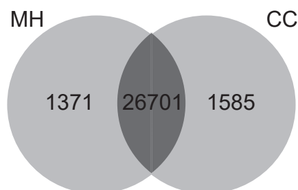
Figure 2. Genes expressed in the varieties "María Huanca" (MH) vs. "Chimbina colorada" (CC) at 0 hpi.