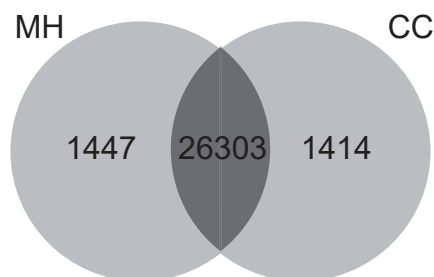
Figure 3. Genes expressed in the varieties "María Huanca" (MH) vs. "Chimbina colorada" (CC) at 72 hpi.

Comparing values of RPKM and Fold Change (FC), we found a group of 100 genes with significant differences in gene expression ( p < 0.05 ) between the control (0 hpi) and infection (72 hpi) treatments. In "Maria Huanca" (resistant variety), we found 2113 and 3088 over and underexpressed genes, respectively. With respect to "Chimbina Colorada" (susceptible variety), we found 3561 and 3440 over and under expressed genes, respectively (Figure 4).