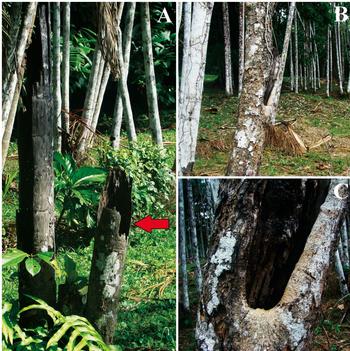
Figure 1. Active Dendroplex picus peruvianus nests in a forest fragment in southwestern Amazonia. (a) Detail of nest 1 (red arrow). (b) Nest 2 in trunk. (c) Detail of entrance of nest 2.

We found nests in open areas near the forest edge (December 2012, October 2013). Nest 1 was built in a broken trunk of a dead Bactris gasipaes palm (Fig. 1a). Nest 2 was built in the cavity of the trunk of a Samanea saman (Fabaceae) (Fig. 1b, c).