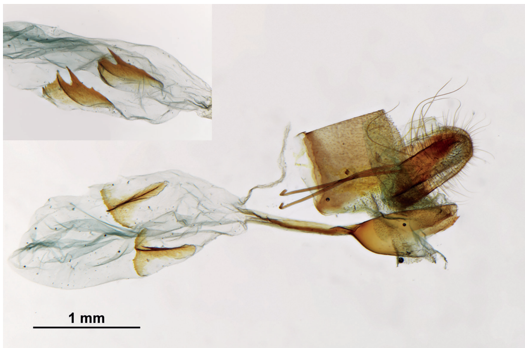
Figure 2. Podanotum pajaten sp. nov., female genitalia in lateral view; details of signa on upper left corner. Scale bar: 1 mm.