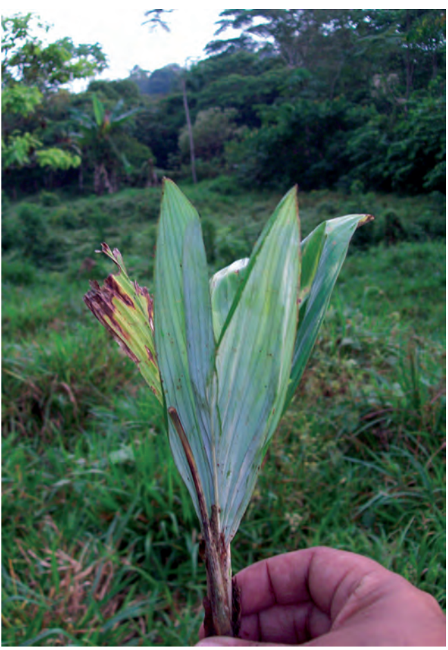
Figure 3. Astrocaryum perangustatum: seedling.

Survey area.- Our study area is located in Pozuzo region,