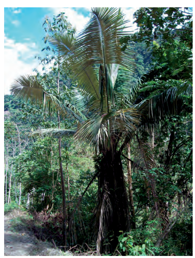
Figure 2. Astrocaryum perangustatum: adult palm.