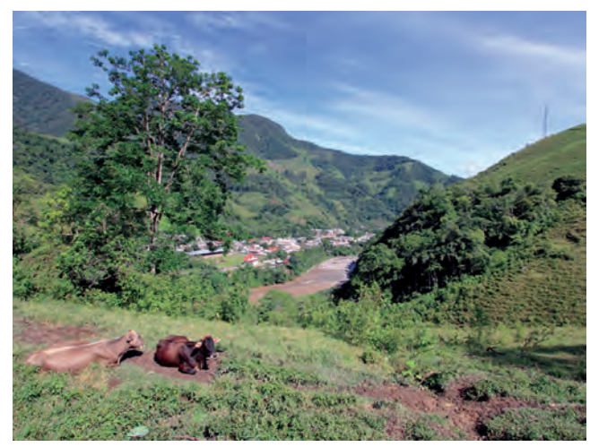
Figure 1. Pozuzo landscape.

stem, at least in its upper part under the crown (Fig. 2). Leaves are regularly pinnate and disposed in one plane. Inflorescences and infructescences are erect and emerge from between the leaf bases. Fruits have the shape of an inverted cone with a remarkably long tapering base. Seedlings have entire, bifid leaves (Fig. 3).