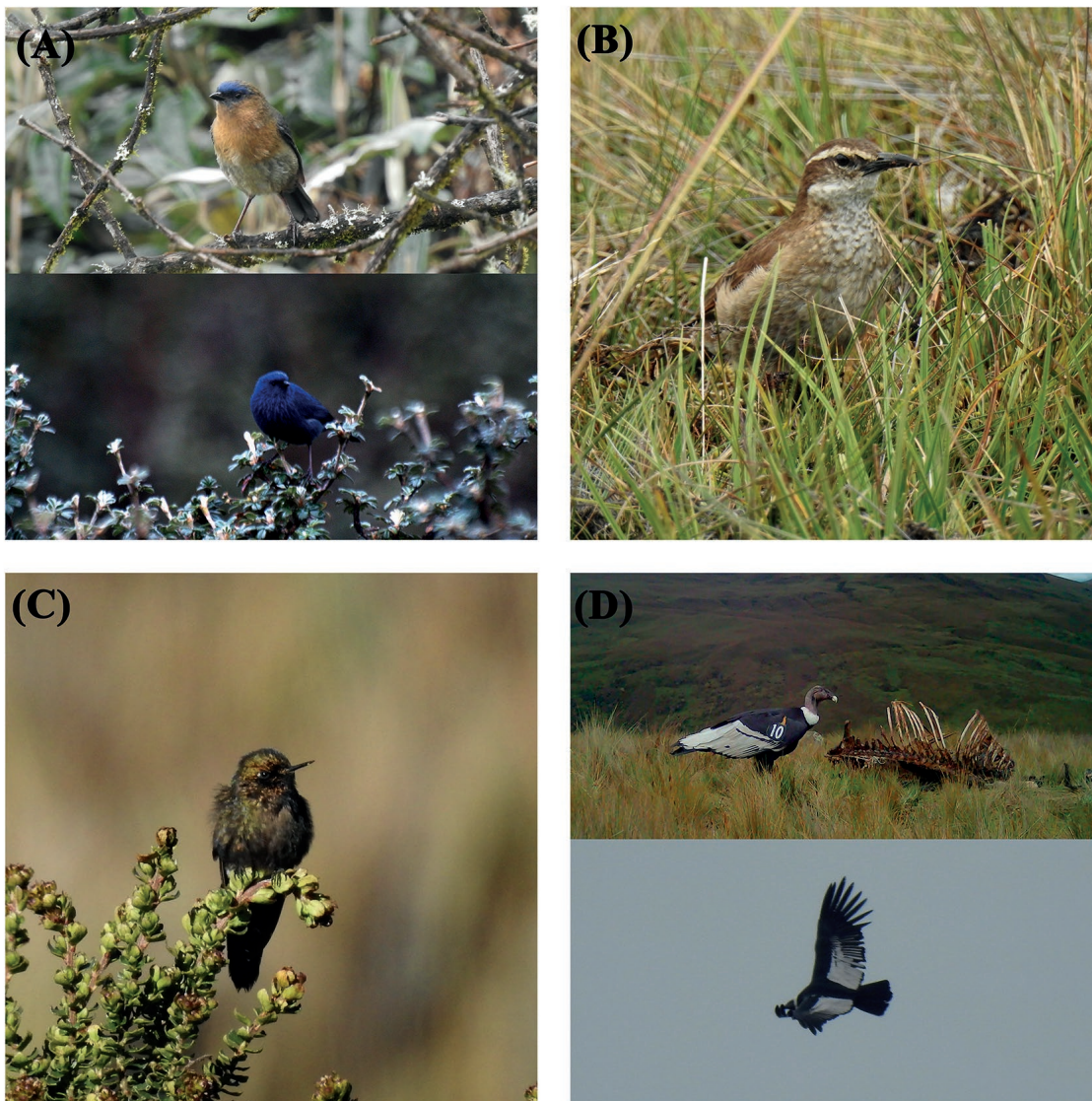
Figure 3. Examples of páramo birds recorded in the Macizo del Cajas Biosphere Reserve (MCB), High-Andes of southern Ecuador. In A, Titlike Dacnis ( Xenodacnis parina ), adult female at upper panel and adult male lower panel; B, Stout-billed Cinclodes ( Cinclodes excelsior ); C, Violet-throated Metaltail ( Metallura baroni ) and D, Andean Condor ( Vultur gryphus ), a wing-banded adult female (named Chunka by Fundación Cóndor in Ecuador) at upper panel and adult male at lower panel.

Finally, habitat affinity among the study area is heterogeneous (Table 2): 87 (78%) species occur in high-elevation Andean Forest edge, scrub, and Polylepis woodland; 43 (39%) of these also use open páramo grasslands as well as open cushion páramo. Moreover, 21 (19%) of species inhabit aquatic habitats, 12 (11%) of which are only found on lakes, marshes or streams.