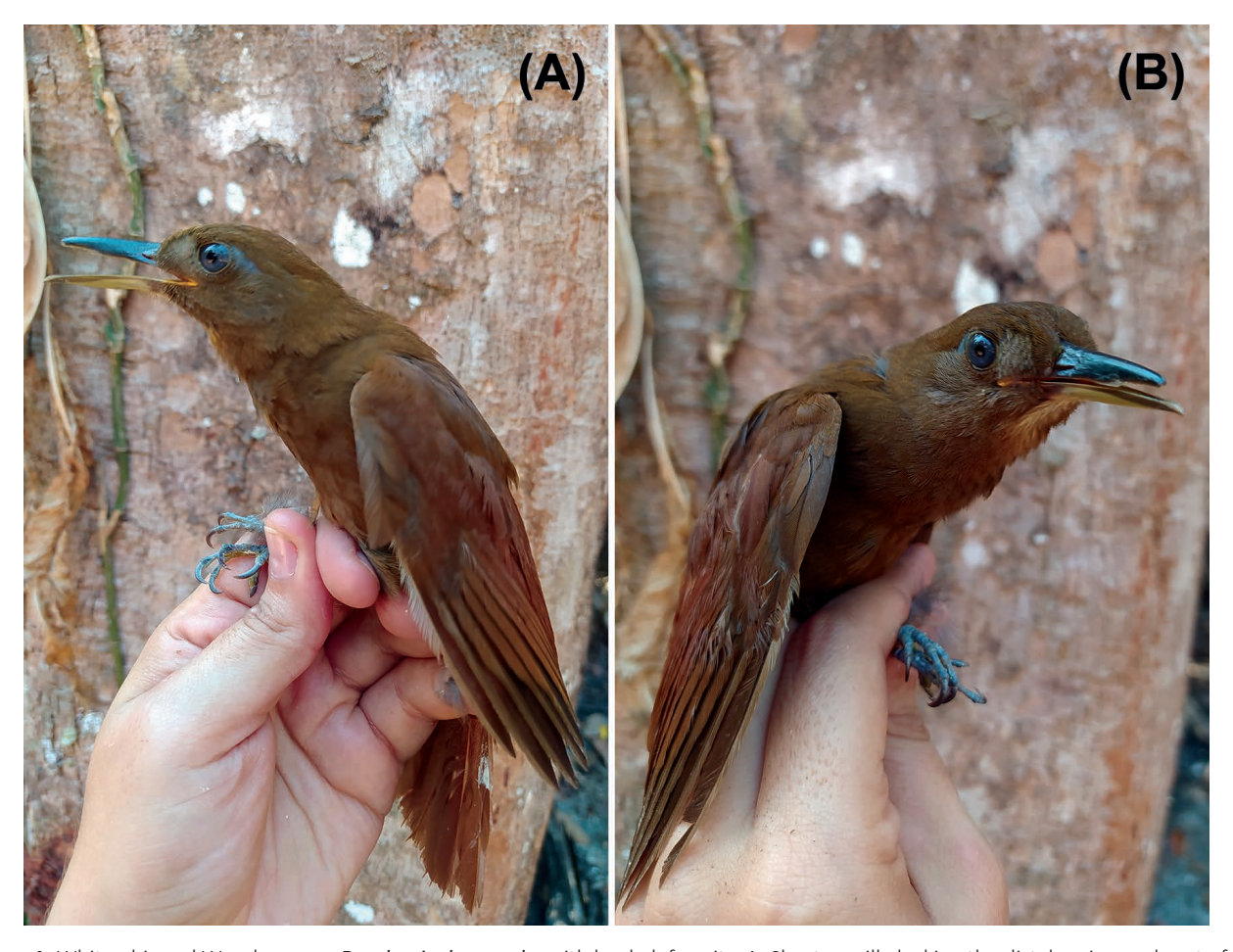
Figure 1. White-chinned Woodcreeper, Dendrocincla merula , with beak deformity. A: Short maxilla lacking the distal region and part of the lateral margin on both sides; B: cleft on the right side of the maxilla.

A specimen of White-chinned Woodcreeper with a deformity in the beak was captured with a mist net on October 6, 2020 in an area covered by dense terra-firme forest, in the municipality of Pauini, Amazonas (08°30'37.6" S, 69 °7'22.9" W). The bird had a shorter maxilla in relation to the mandible (Fig. 1A). The mandible lacked a tip and a side part on both sides. On the right side, it was also possible to observe a small fissure (Fig. 1B). After obtaining the biometric data, the bird was released close to the capture site and flew normally. We were unable to record the specimen feeding, but it appeared to be healthy at the time of capture.