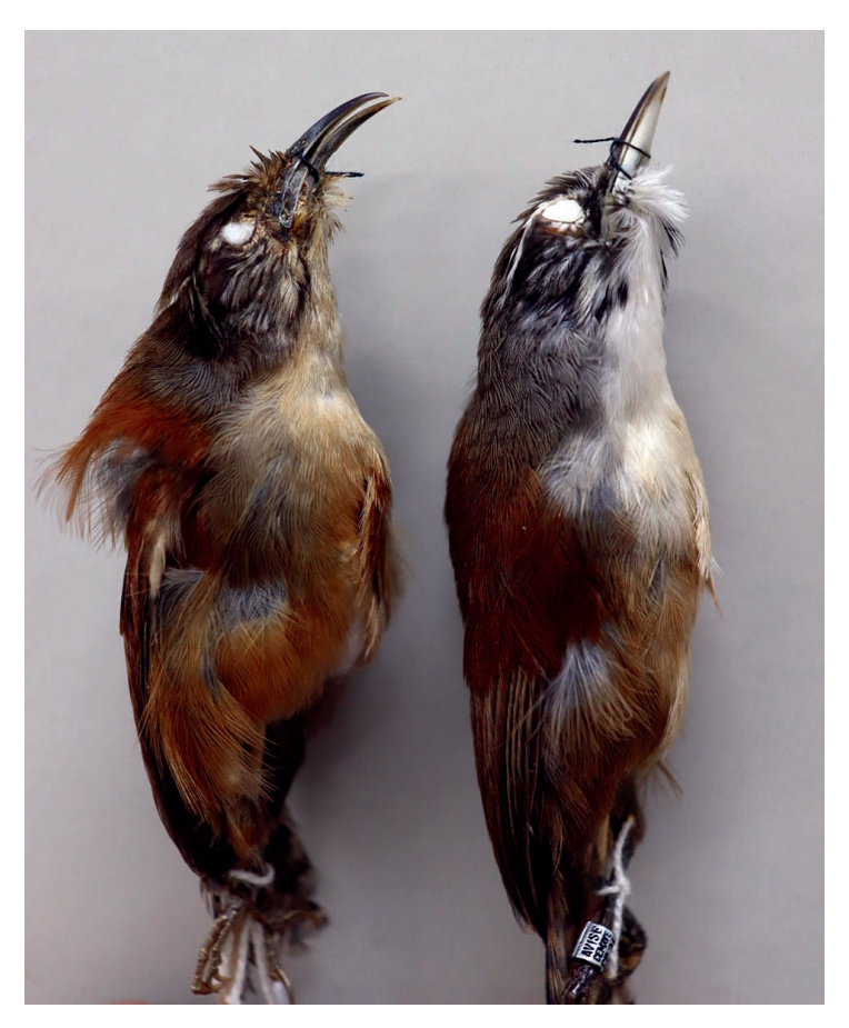
Figure 3. Moustached Wren, Pheugopedius genibarbis , with beak deformity compared to a normal beak specimen (right). Note the curvature of the maxilla and the longer mandible of the specimen on the left. Specimens belonging to the ornithological collection of the Federal University of Acre (Example with beak deformity: AC-443; specimen without beak deformity: AC-223).