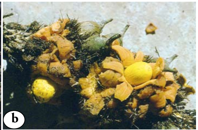
Figure 2. Subgenus Munbaca — a) habit of Astrocarium gynacanthum ; b) fruit of A. rodriguesii , with epicarp splitting at maturity.

Hexodon is abandoned; this latter being treated under synonymy of the genus Hexopetion (Pintaud et al., 2008).