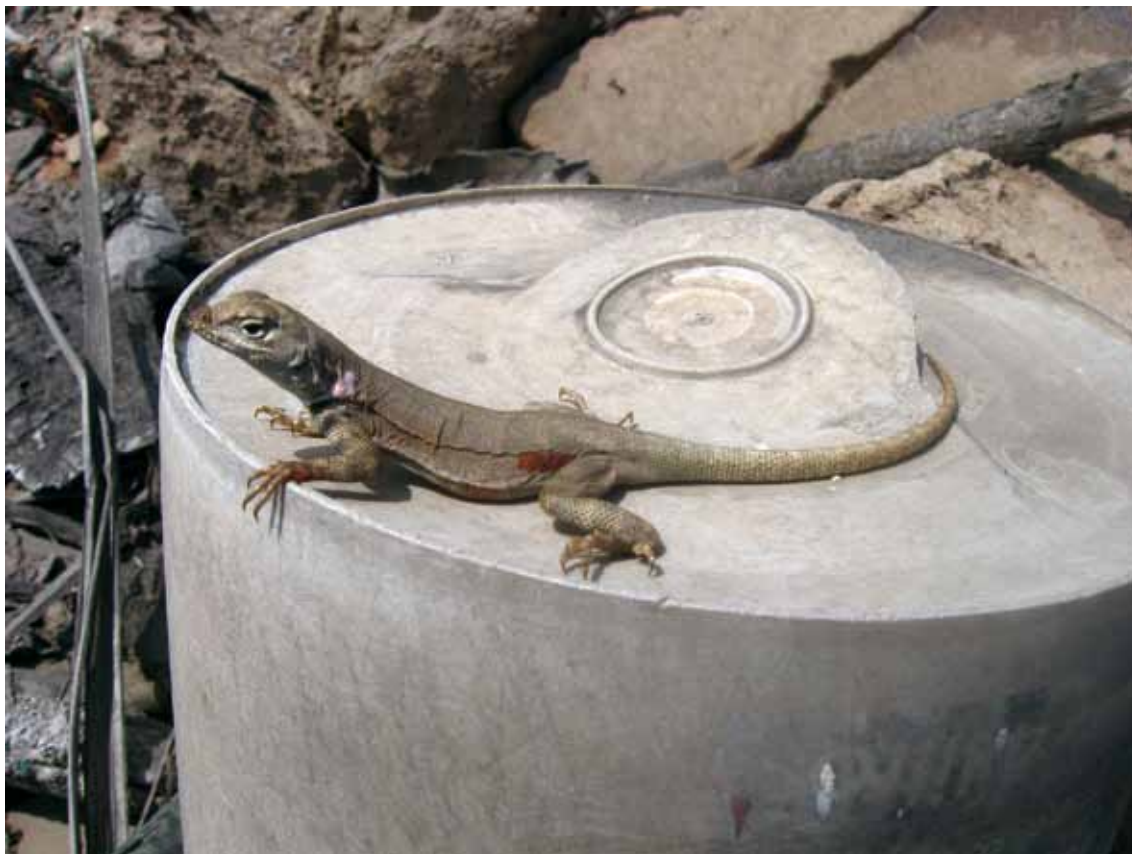
Figure 1. Microlophus tigris (female) basking on a plastic cylinder on Las Leyendas Zoological Park.

classified as follows: 1) bushes/vegetation debris, 2) pre-hispanic ruins (also named “huacas”: pre-hispanic constructions made from hand-made mud bricks), 3) construction debris, 4) stones and 5) other (metal material, garbage). Visual encounter surveys (Crump & Scott 1994) with no time limits were employed to collect data on activity time and microhabitat use of individual lizards, from 09:00 to 17:00 during 25 days (200 hours/man). Individuals were captured by hand or with a custom-made noose to record their body temperature with a cloacal thermometer Miller and Weber® within 30 seconds after captured. Individuals were caught by legs to avoid heat transfer from the investigator. Substrate temperature was recorded at the exact place where the lizard had been captured by pressing the bulb against the substrate. Air temperature was recorded one centimeter above the substrate at the same place.